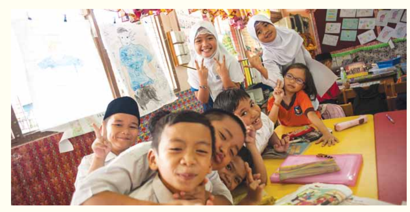
Students at a Malaysian Trust Scho

But the declining reputation of government schools means reform is no longer an option; it is a necessity. Confidence in state institutions has fallen so low that parents are increasingly looking for alternatives – whether private local curriculum, private international curriculum or vernacular language – undermining the unity-building objective of mainstream schooling and raising the risk of deepening inequity.