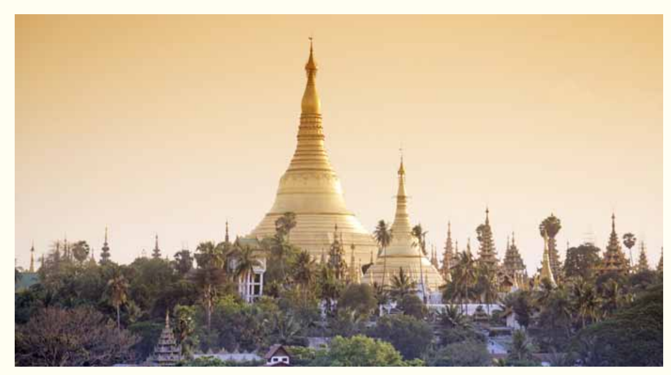
The Shwedagon Pagoda is in Yangon, Myanmar

Myanmar are worrying about bread-and-butter issues – jobs and the cost of living – but also the country's continuing ethnic conflicts. The NLD won 43 of the 45 seats contested in the polls held for "vacant" seats two years ago, but the Myanmar military has devised a transition that ensures its continuing influence over the political process whoever the voters back in 2015.