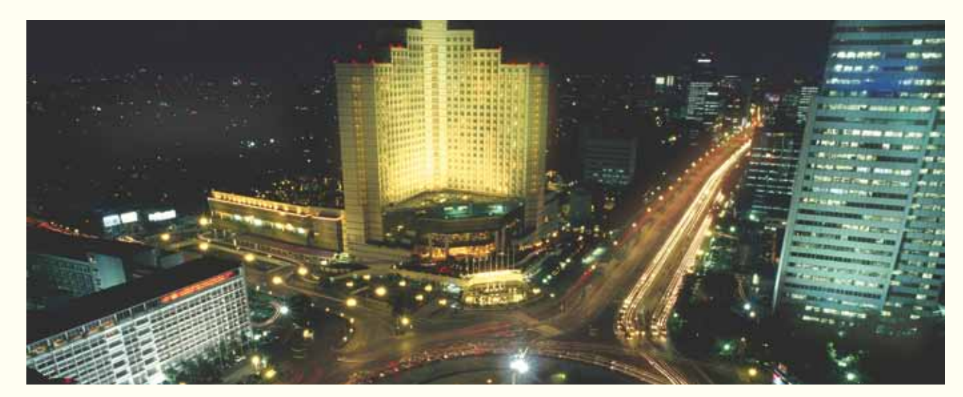
Indonesia's bustling city, Jakarta

*The Institute of Democracy and Economic Affairs is Malaysia's first think tank dedicated to promoting market-based solutions to public policy challenges.