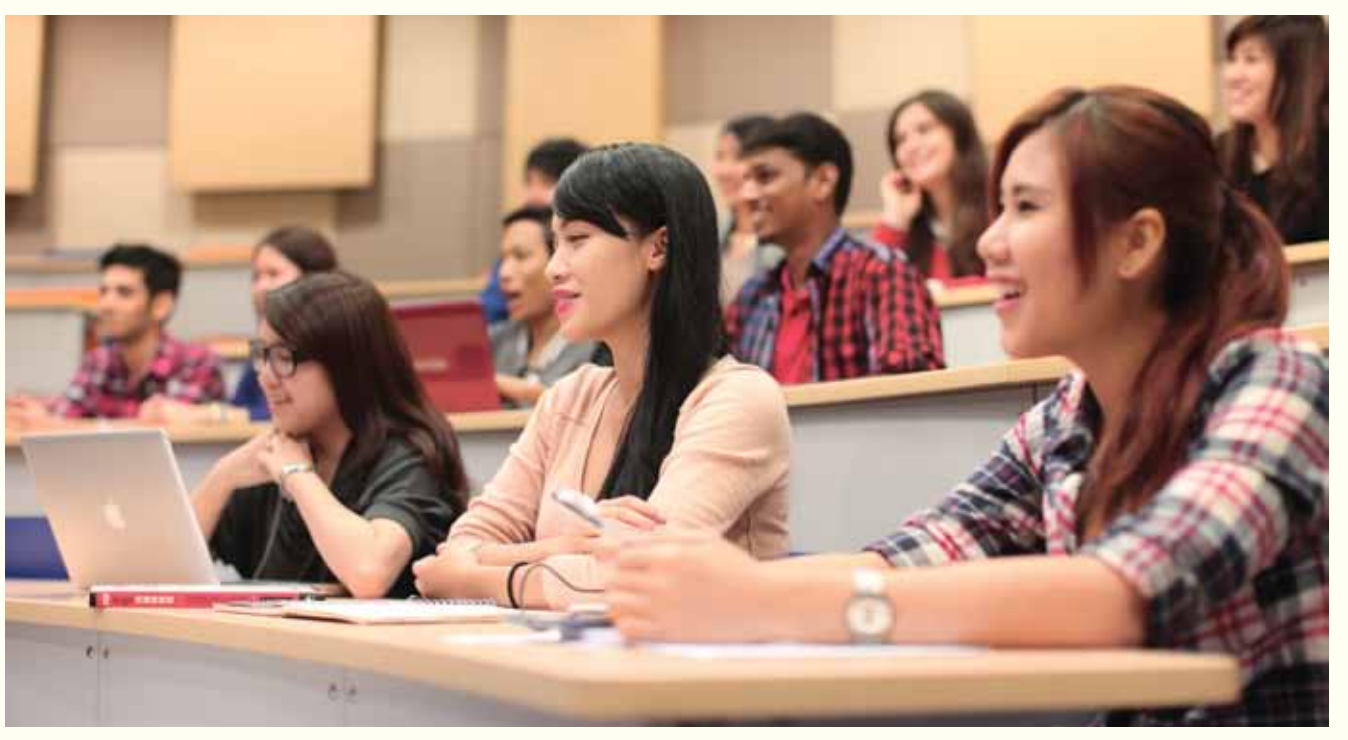
Students at Sunway University

http://www.nytimes.com/2014/06/20/opinion/denying-democracy-in-myanmar.html?\_r=0