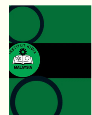
Malaysian Journal of Chemistry