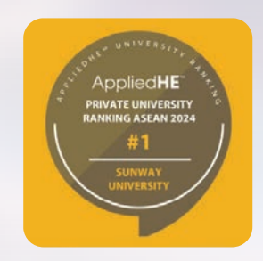
AppliedHE University Rankings #1 Private University Ranking in ASEAN 2024

The 1st Non-government Linked Private University in Malaysia to obtain: