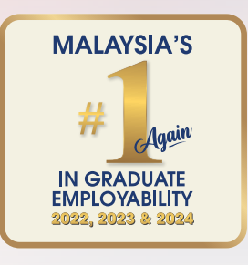
Sunway University ranked No. 1 in Graduate Employability in Malaysia for 3 consecutive years by Talentbank

Malaysia's No.1 private non-government linked university