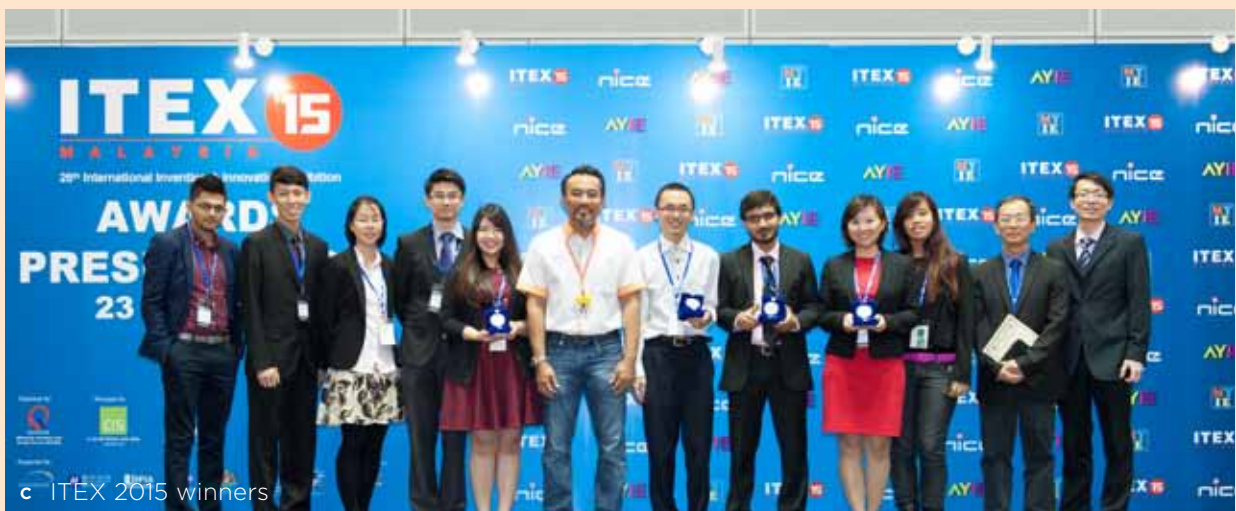
c ITEX 2015 winners