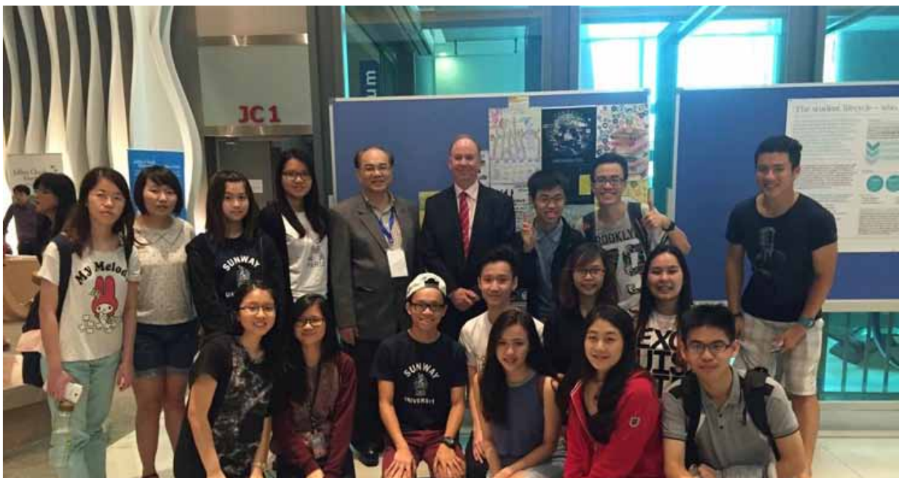
Poster Paper Winners from Sunway University Business School at the GAPS Conference

In October we also passed another milestone in holding for the first time two graduation ceremonies following the growth in the annual number of successful graduates. We were fortunate to have the new Chancellor of Lancaster University, our main teaching partner institution, present for the ceremony, the Right Honourable Alan Milburn, Chair of the Social Mobility and Child Poverty Commission for the UK and former British Health Minister. Alan Milburn also gave a Jeffrey Cheah Distinguished Speaker Lecture on the theme of “Bridging the Great Divide – How Social Mobility Can Be a Reality”.