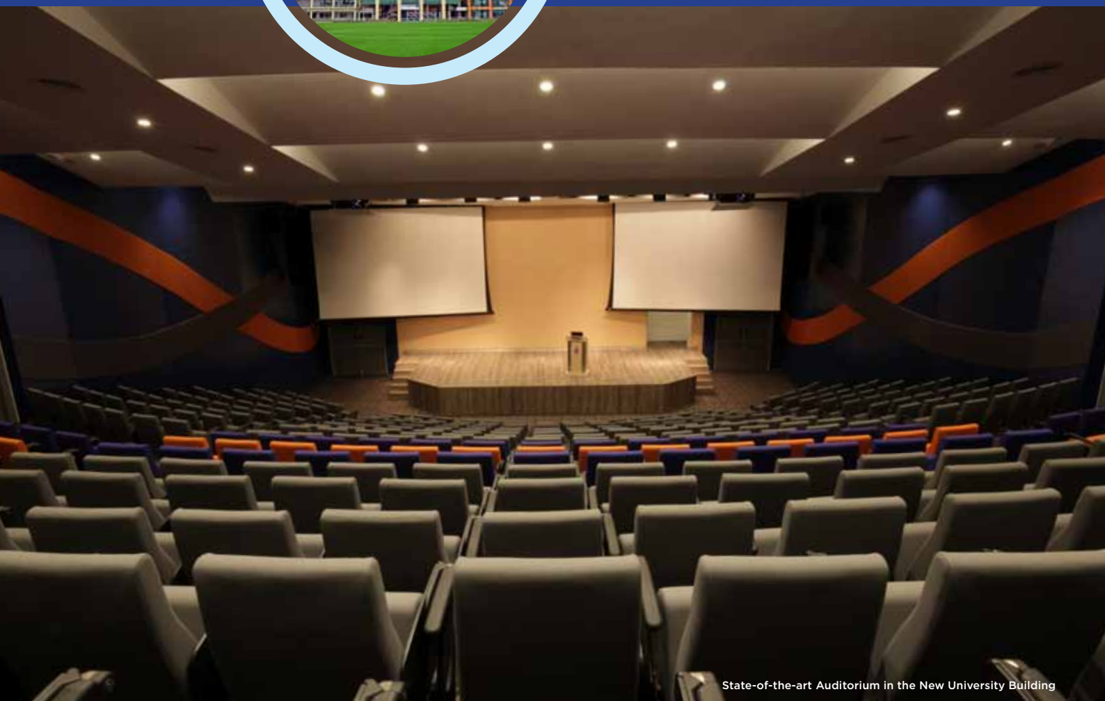
State-of-the-art Auditorium in the New University Building