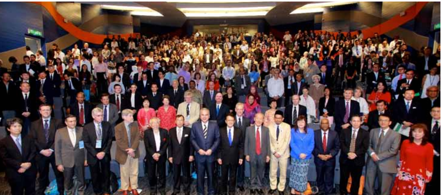
The Oxford University Annual Symposium on Southeast Asian Studies

Early in the year we received our results from the i-Graduate International Student Barometer Survey conducted late in 2014. The results placed us overall as the best university in Malaysia out of all those which entered. Apart from that, the student scores placed us as the leading university in Asia for employability, an accolade that demonstrates the quality of our education in terms of enhancing our graduates' employment opportunities.