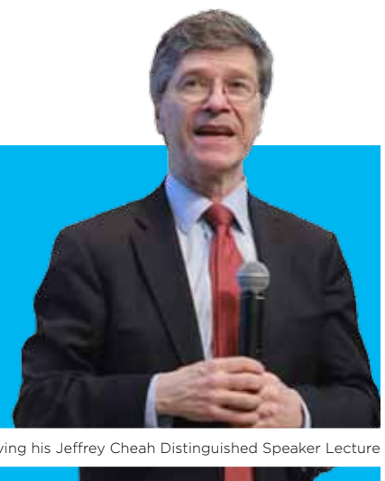
Professor Jeffrey Sachs, Columbia University, giving his Jeffrey Cheah Distinguished Speaker Lecture

The event was held in conjunction with the Asian Economic Panel Conference and attracted distinguished speakers from around the world. One of these was Professor Jeffrey Sachs of Columbia University, Special Adviser on the Millennium Development Goals to Ban Ki Moon, UN Secretary General, who gave a Jeffrey Cheah Distinguished Speaker Lecture on the theme of "The Age of Sustainable Development".