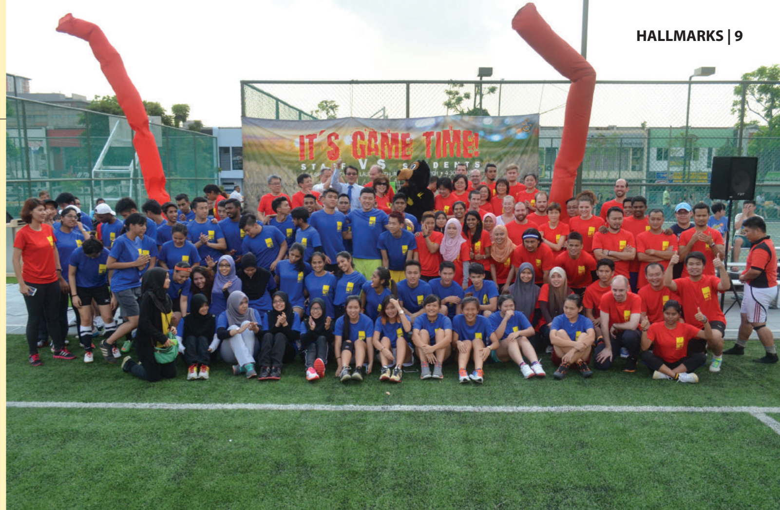
FUN AND GAMES: The crowd were excited to start using the awesome facilities!