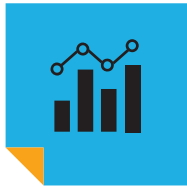
BSc (Hons) Financial Analysis