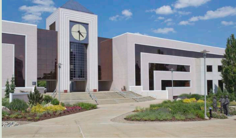
CENTRE OF KNOWLEDGE: The Dwigth B. Waldo Library at the WMU campus.

Bachelor in Computer Science. “It was definitely quite an experience, and I am glad that I went through the twinning programme. During my final