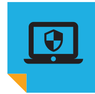
BSc (Hons) Information Technology (Computer Networking & Security) [Validated by Lancaster University, UK]