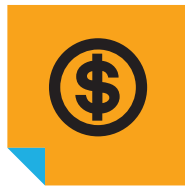
BSc (Hons) Financial Economics