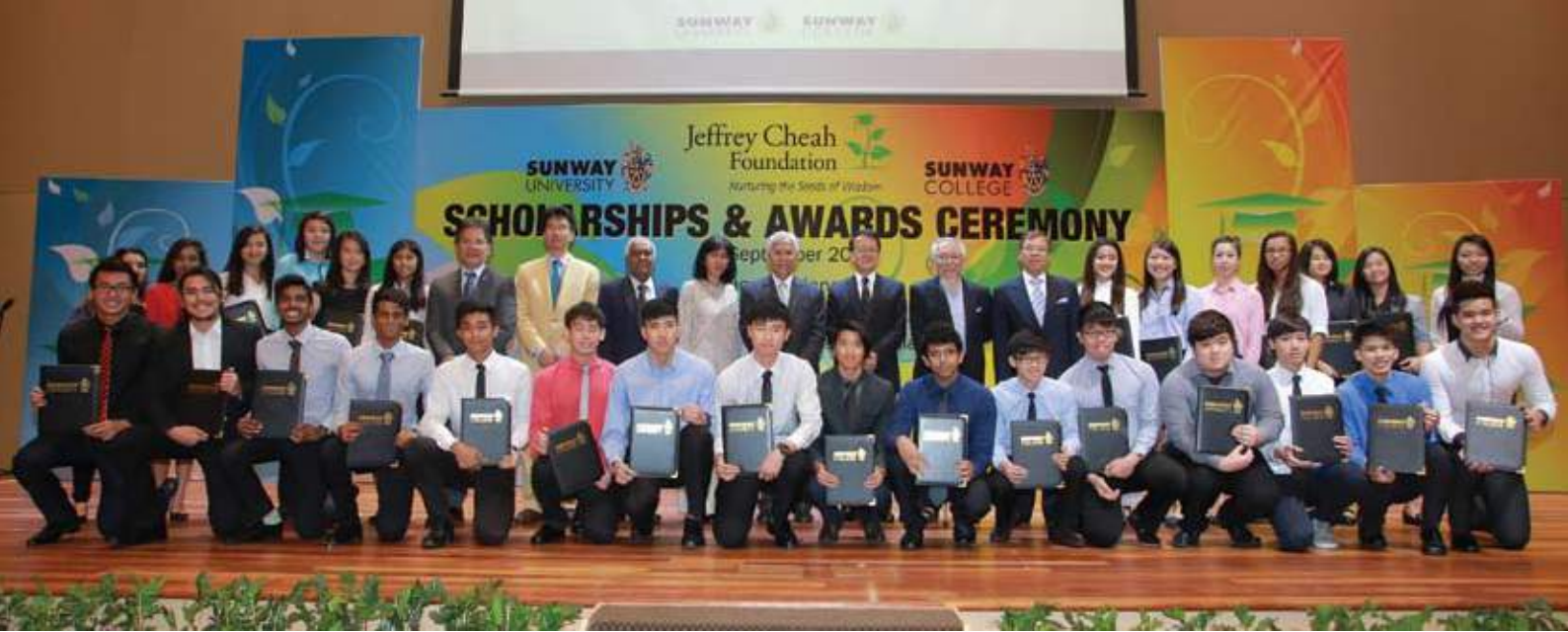
TOP ACHIEVERS: The recipients of the Sunway Sports and Music Scholarships pose with the guests of honour.