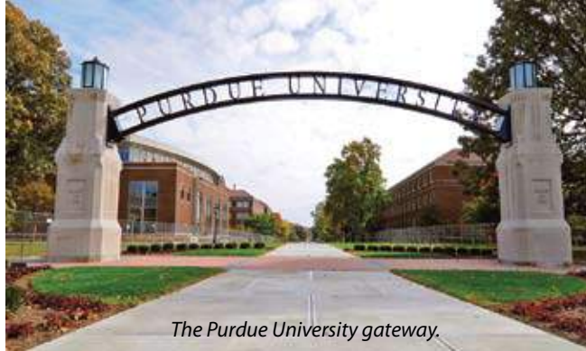
The Purdue University gateway.

What made me choose to do the ADTP at Sunway University? It was familiar to my