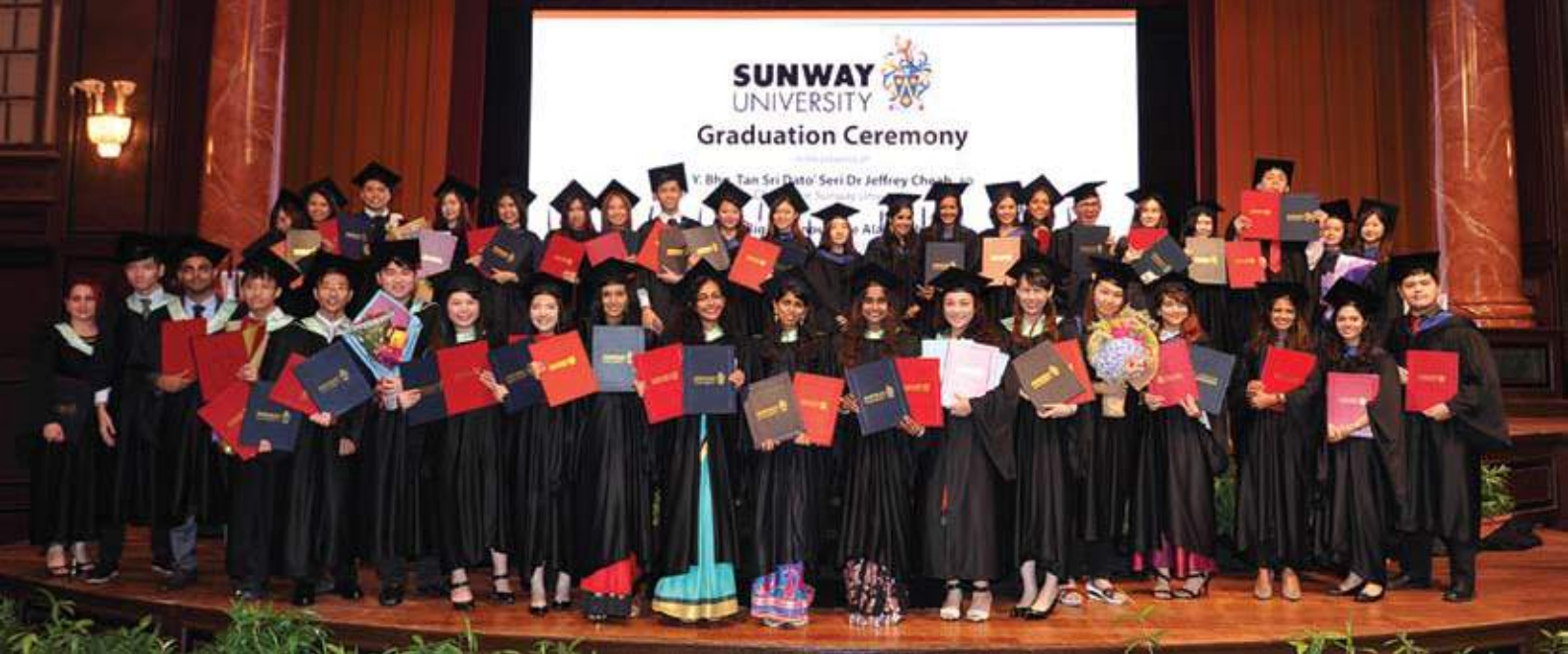
PROUD MOMENT: The graduates with their hard-earned qualifications.