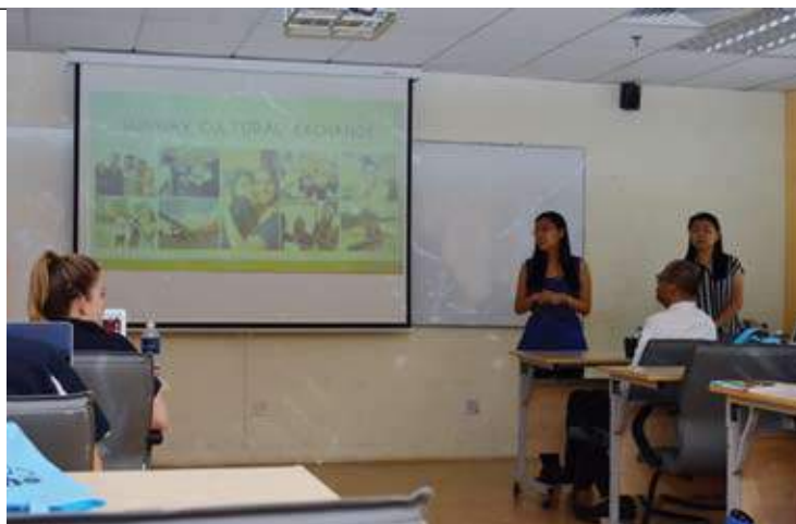
CULTURAL EXCHANGE: The students from Australia found the lectures and forums extremely beneficial for their assignments.

To prepare Adelaide Law School students for what expect in the near future, they were introduced to areas of history, laws and institutions which will underpin this growth, to learn about relevant government policies, infrastructure and laws, with a particular emphasis on the relationship between Singapore, Malaysia and Australia. The visits included lectures from academics, business and government, cultural tours, site visits, universities and historic