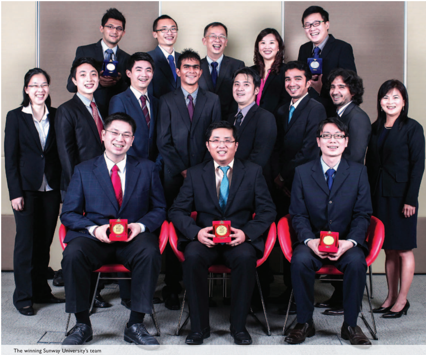
The winning Sunway University's team

Beaming with smiles, Sunway University's Faculty of Science and Technology took home 3 Gold and 2 Silver awards during the 25th International Invention, Innovation and Technology Exhibition (ITEX 2014). This is part of the university's aim to expose students and lecturers to real-world experience, which is invaluable in today's fast-paced information and technology industry.