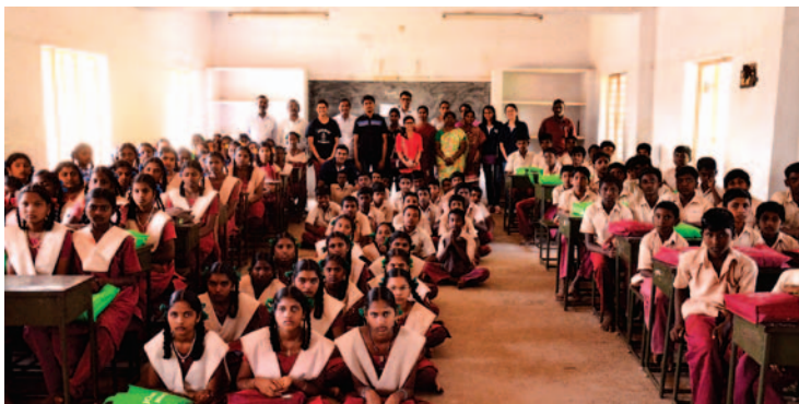
The JCharity Team with teachers and organizers (India) and the children at the school

The visit to Belukurichi was more than an attempt to show a little kindness. It has been an eye-opening and humbling experience for the students, motivating them to help other disadvantaged communities.