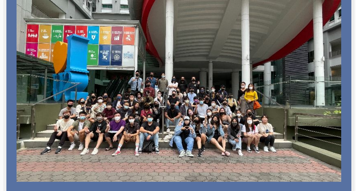
DFP End-of-Semester Showcase: "Watch My Film lah!"

"Watch My Film lah!" celebrates the films produced by the BA (Hons) Digital Film Production students. Held on 18th and 19th July, the event was set to encourage the students to claim ownership of their work.