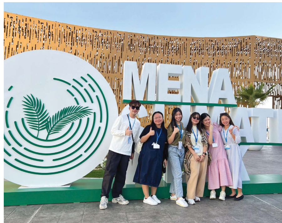
2023 student visit to MENA (Middle East and North Africa) Climate Week in Riyadh, sponsored by the Ministry of Tourism Saudi Arabia, for the Youth Summit Initiative.