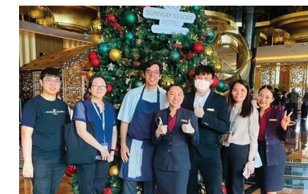
Internship students at Sunway Resort Hotels.