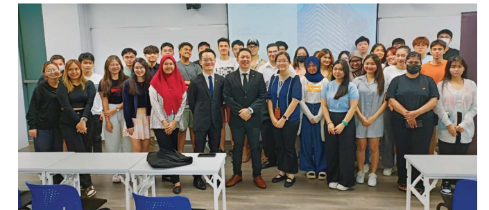
Internship Preview with Intercontinental KL.