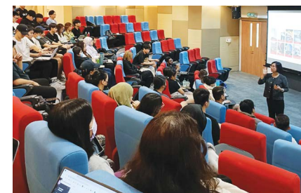
An Internship preview with Sunway City KL Hotels.