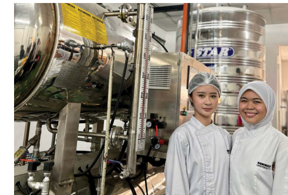
A field trip to learn about retort processing, a food preservation technique.

These are the recommended electives for this programme. However, students can also choose free electives offered university wide. The electives are subject to availability.