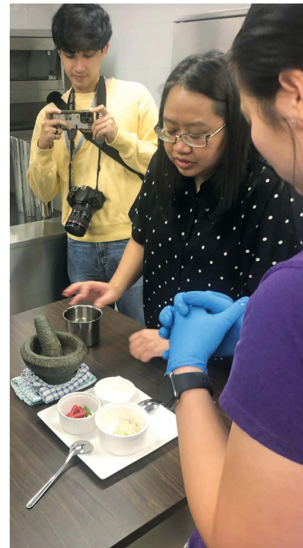
Unravelling the rich heritage and origins of Baba Nyonya cuisine.