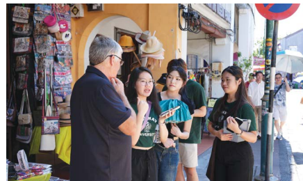
Gentrification and its social impact – a study of gentrification in Penang island.