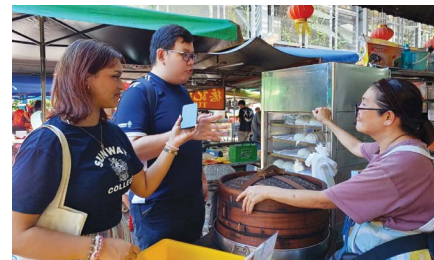
Exploration of Penang's street food culture and its economic impact.