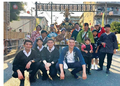
Attending the Urayasu festival (a traditional event held every four years) during the Meikai University exchange.