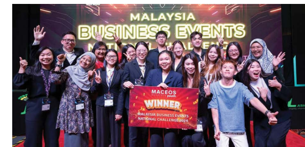
2 winning teams for the 2024 Business Events National Challenge.