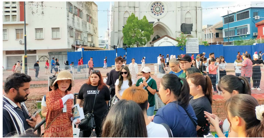
Tracing the footprint of history and heritage in Malacca.

Understanding the hospitality industry through practical research