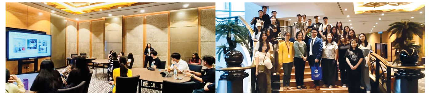
Sustainable Practices supported by Sunway Resort Hotels 2023.