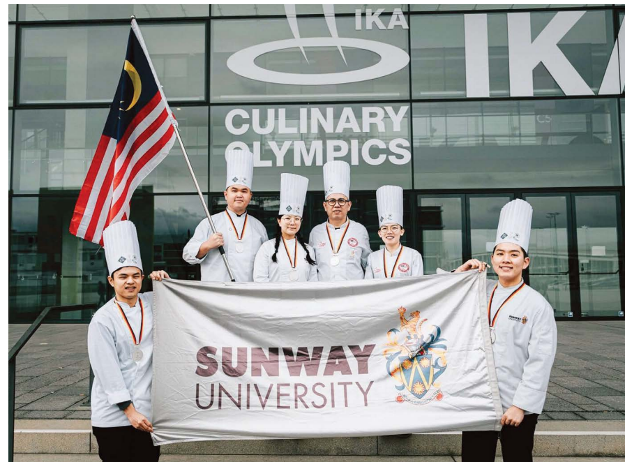
2024 IKA Culinary Olympics - Stuttgart, Germany.