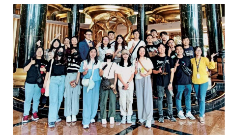
Sustainable City Destination Programme hosted by Sunway Resort 2023.