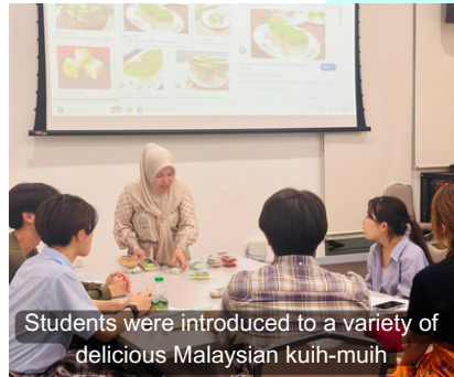
Students were introduced to a variety of delicious Malaysian kuih-muih

A highlight of the programme was a buka puasa gathering during Ramadan, which deepened cultural appreciation and built lasting relationships among participants. The programme underscores the School's commitment to global engagement, preparing students to thrive in diverse and interconnected educational contexts.