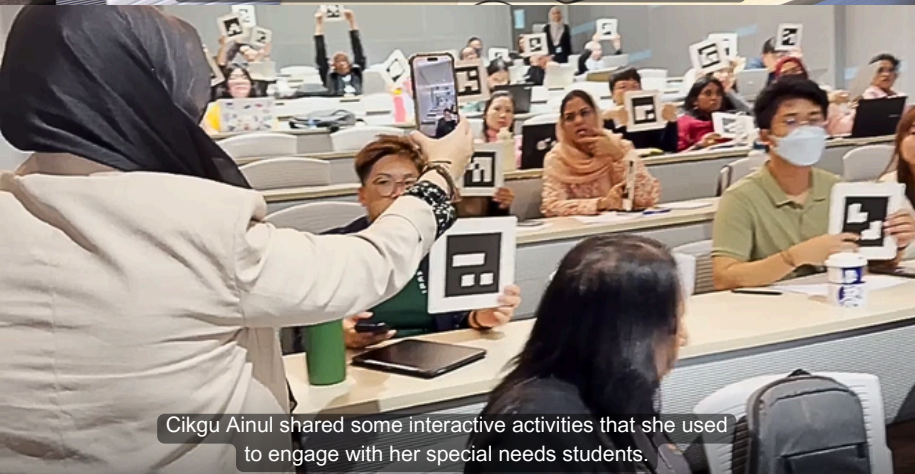
Cikgu Ainul shared some interactive activities that she used to engage with her special needs students.