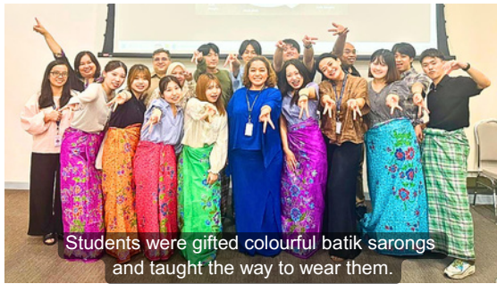
Students were gifted colourful batik sarongs and taught the way to wear them.

The School of Education, Sunway University, recently hosted students from Kansai Gaidai University through a vibrant mobility programme that promoted cross-cultural learning and academic exchange.