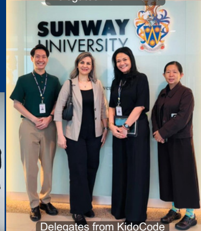
Delegates from KidoCode