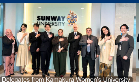
Delegates from Kamakura Women's University