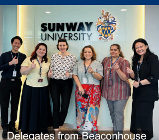
Delegates from Beaconhouse