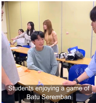
Students enjoying a game of Batu Seremban

Through interactive workshops and collaborative activities, students explored diverse educational practices while engaging with peers and academics. These experiences enhanced intercultural understanding, strengthened global perspectives, and fostered meaningful peer connections, enriching learning beyond the classroom.