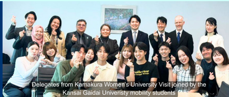
Delegates from Kamakura Women's University Visit joined by the Kansai Gaidai University mobility students

We look forward to these meaningful collaborations as we continue our mission to contribute to the betterment of society - empowering individuals, strengthening communities, and advancing education for a more inclusive and sustainable future.