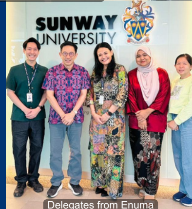
Delegates from Enuma